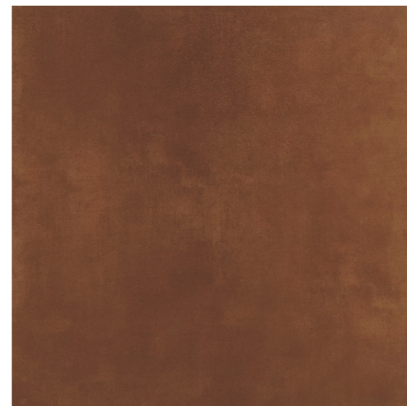
CHC 6060007 ALMOND BROWN