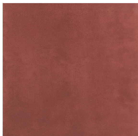
CHC 6060003 CORAL PEACH