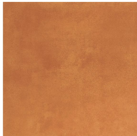
CHC 6060002 MARMALADE ORANGE