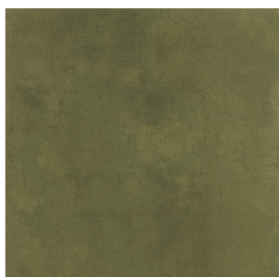
CHC 6060005 SPICE OLIVE