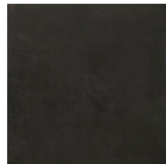
CHC 6060010 GOTHIC CARBON