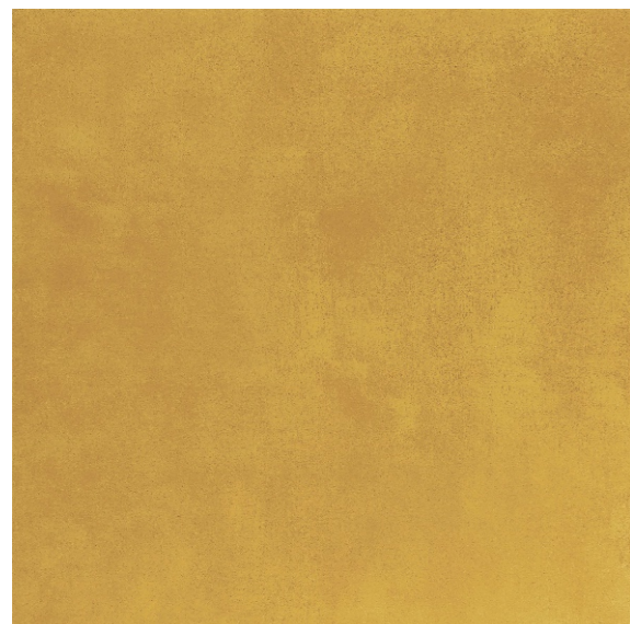
CHC 6060001 SUMMER YELLOW