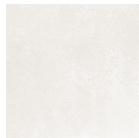
CHC 6060012 SHELL WHITE