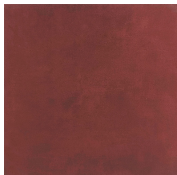
CHC 6060004 CRIMSON RED