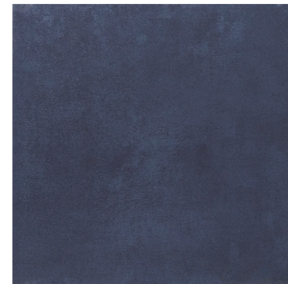
CHC 6060008 ORIENTAL INDIGO