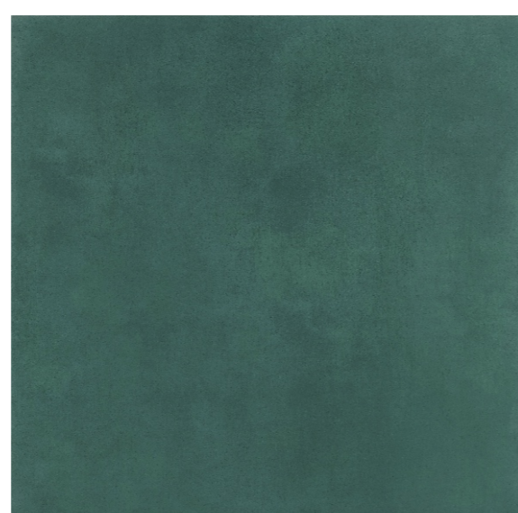
CHC 6060006 SEASIDE GREEN